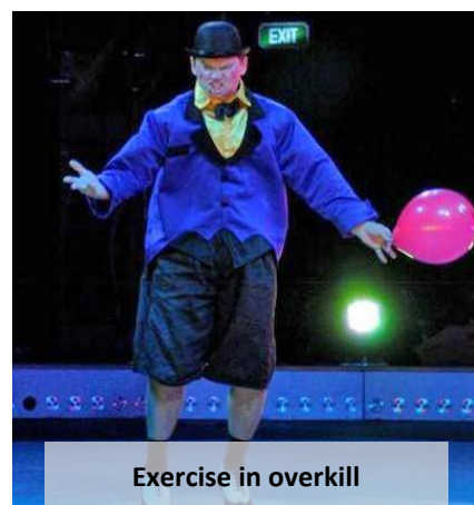
Exercise in overkill

We're not sure what they decided in the end, although one community member suggested that there were already three clowns onsite and that maybe a fourth clown was an exercise in overkill.