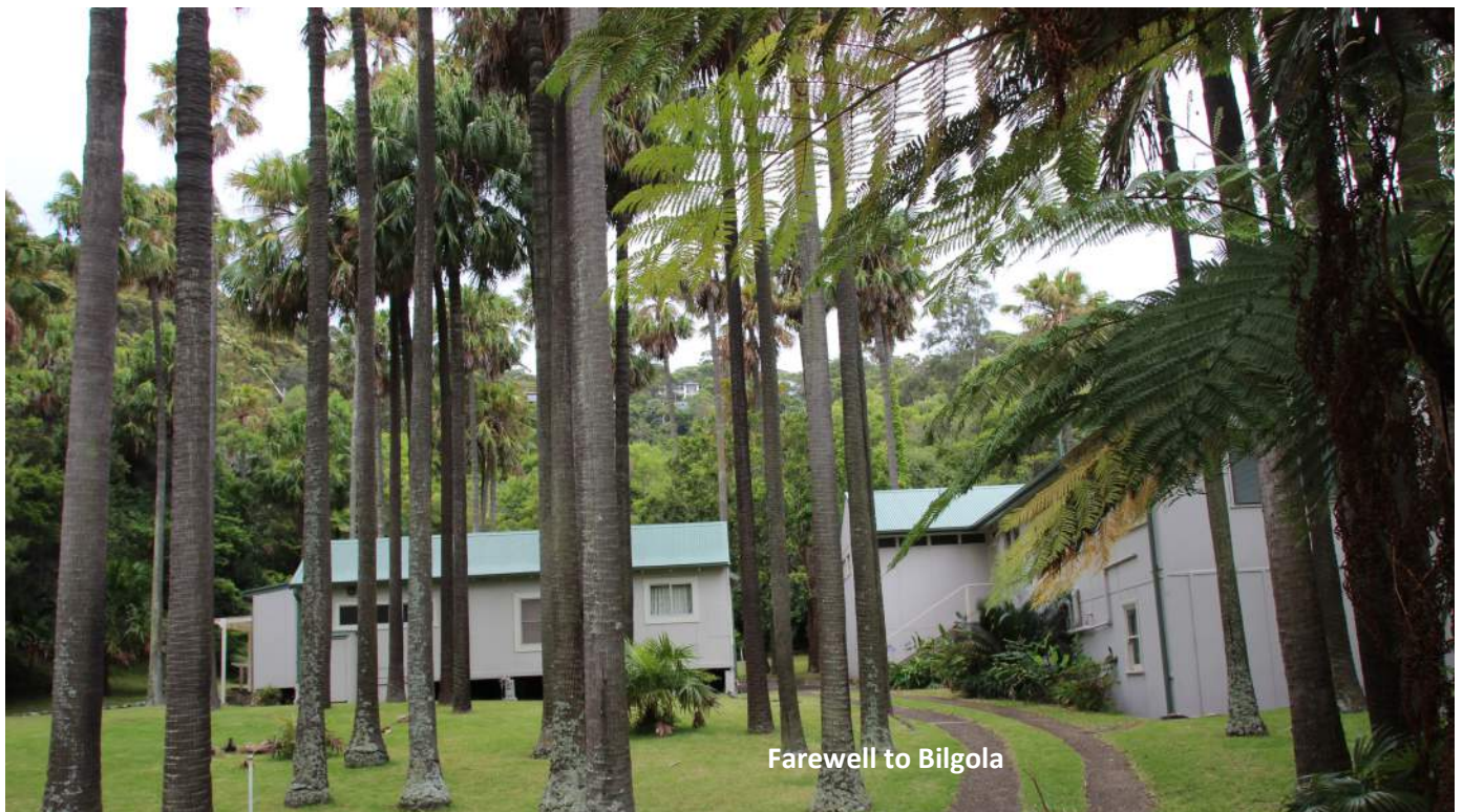
Farewell to Bilgola

Those early Marists got others, men and women who became religious and some lay friends too, to share their "mad" dream.